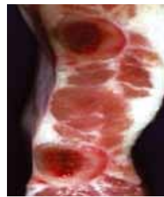
Pork meat analysis