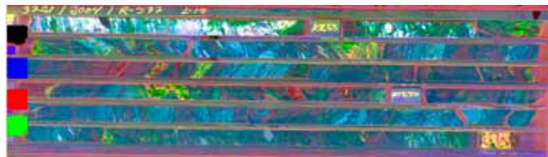
Drill core image processed by Finnish Geological Survey