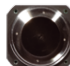
ImSpector V8E/V10E spectrograph, front view