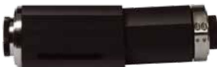
ImSpector V8E/V10E spectrograph, side view